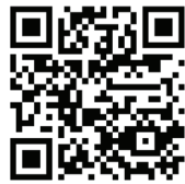
NetBenefits® for iPad®

Connect with a rep instantly by tapping "Give Us a Call"